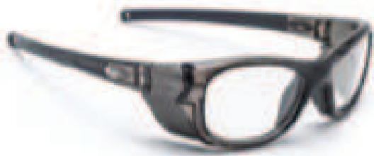
R X – Q100