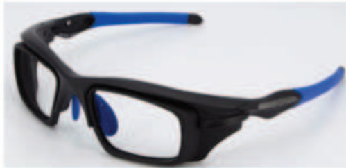
Matte Black with Blue Temple Ends