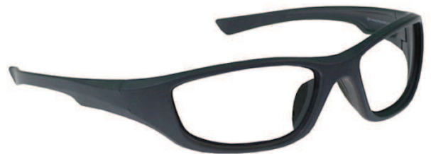
Charcoal Blue Grey

Sharp corners and stylish angles make the 703 a great addition to anyone's sunglass or safety frame collection. This frame comes with perforated rubber nosepieces for increased breathability. The 703 is classic cool and begs to go outside. ANSI Z87.1-2003 APPROVED.