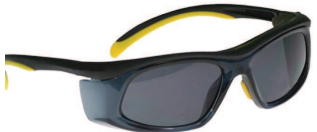
Black Yellow with Smoke Grey

Finally, a really cool look to wear in hot and dusty environments! With great features and benefits to match, the 206 has that "wrap" look combined with a flatter lens pocket that will accommodate most prescriptions. This frame comes with clear or smoke gray side shields to match the environment you expect to be working in, and a removable dust dam prevents sweat and debris from falling into your eyes from above.