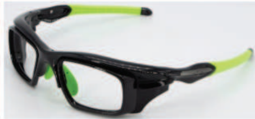
Matte Black with Neon Green Temple Ends

Warrior 101 Wraparound Safety Glasses Size Medium 54-20-125