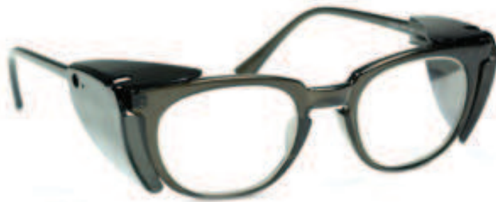
Transparent Black with Black Opaque Side Shields

Comfortable fit 70-PC frame in transparent black, equipped with removable side shields. Size Small to Medium 45-25-140