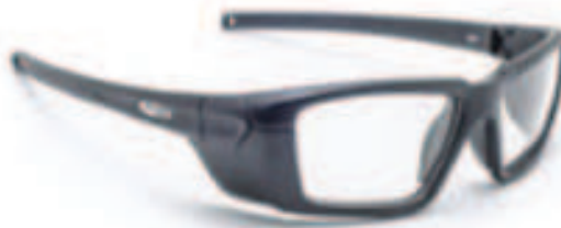
R X – Q300

This plastic wrap frame incorporates a rectangular shape and the durable and lightweight design assures a secure fit. ANSI Z87 Safety APPROVED.