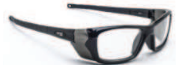
R X – Q200